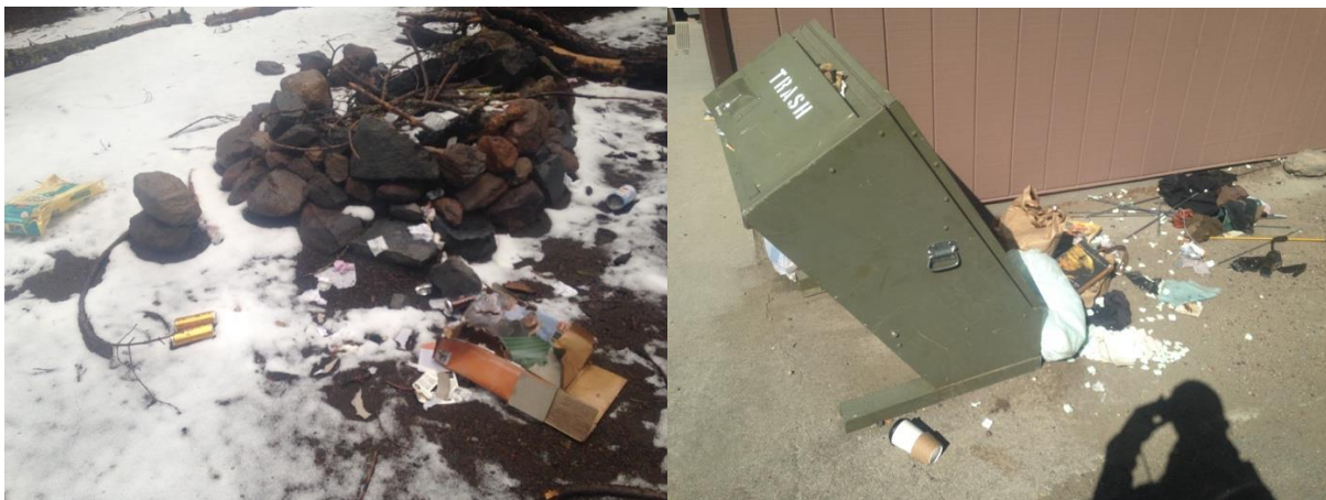
Left: Typical abandoned camp in dispersed camping areas on Mount Shasta. Right: Standard trash situation after a busy weekend at Bunny Flat.

Exceeding 30 Day Stay limit: We often run into folks in Mount Shasta who want to spend the summer "living" in the Mount Shasta/McCloud district. Rangers must do their best to keep track of folks and their stay limit on the forest.