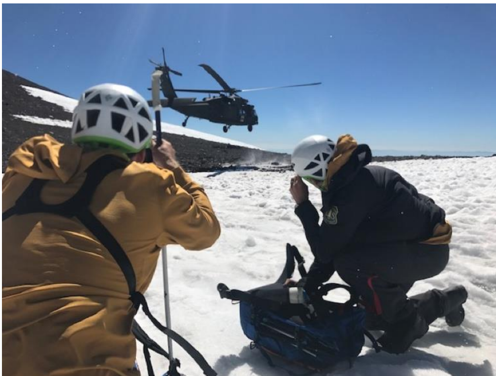
Above: Rangers hunker down at the bottom of Misery Hill after off-loading from the California National Guard Black Hawk helicopter. This mission was part of a search for a female climber on the east side of the mountain in late July.

Fracture 1 Laceration 0 Abrasion 0 Bruising 0 Sprain/strain/tear 2 Concussion/Head Trauma 1 Hypothermic 0 Frostbite 1 Dislocation 0 Puncture 0 Internal 0 AMS 0 Avulsion 0 Dehydration/exhaustion 3 Death 0 Blister 0 None 0 Other 0