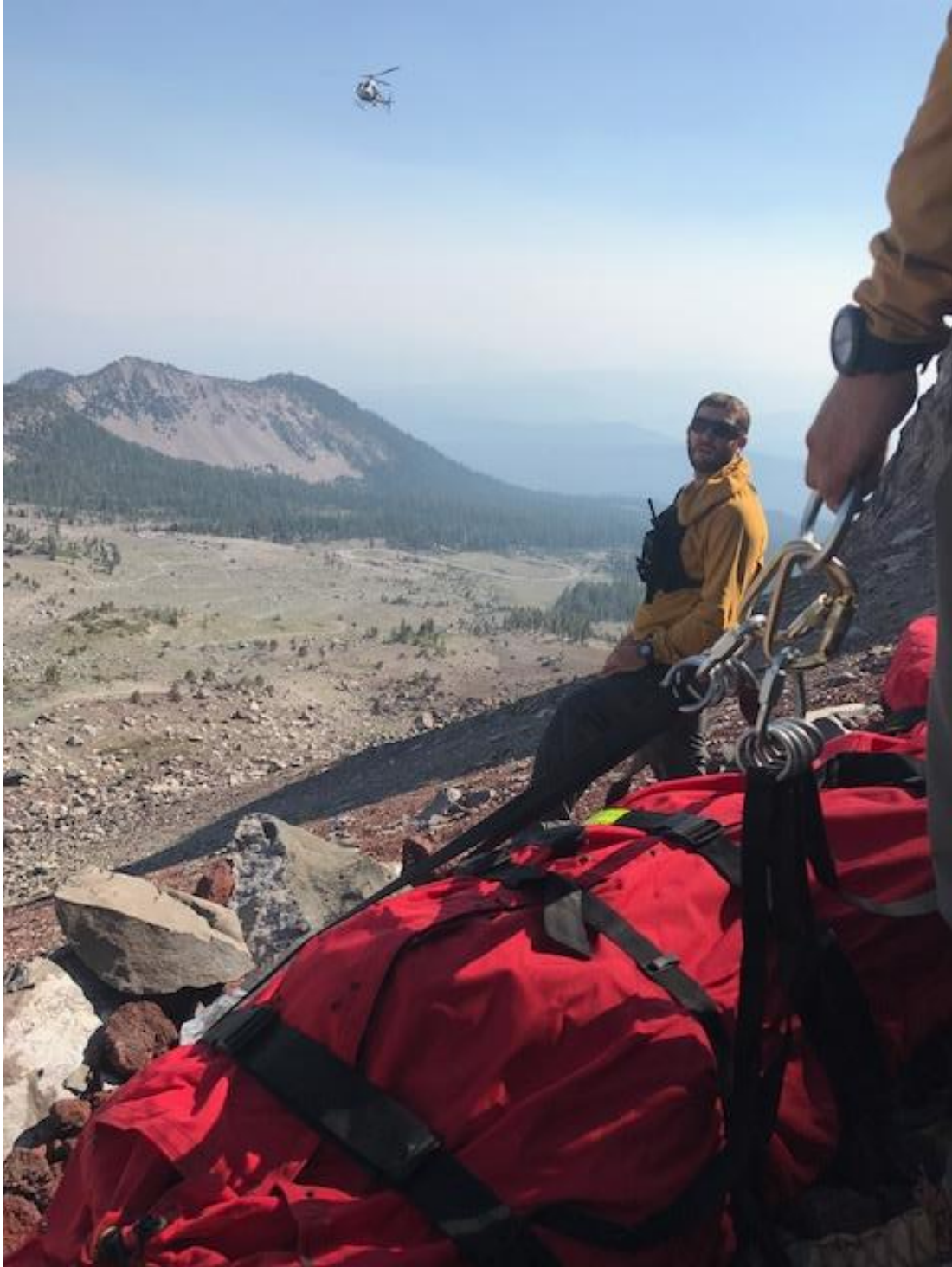
Above: Rangers prepare for a hoist operation out of the Old Ski Bowl.