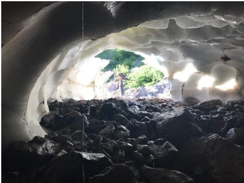
A very cool snow cave eroded by Mud Creek