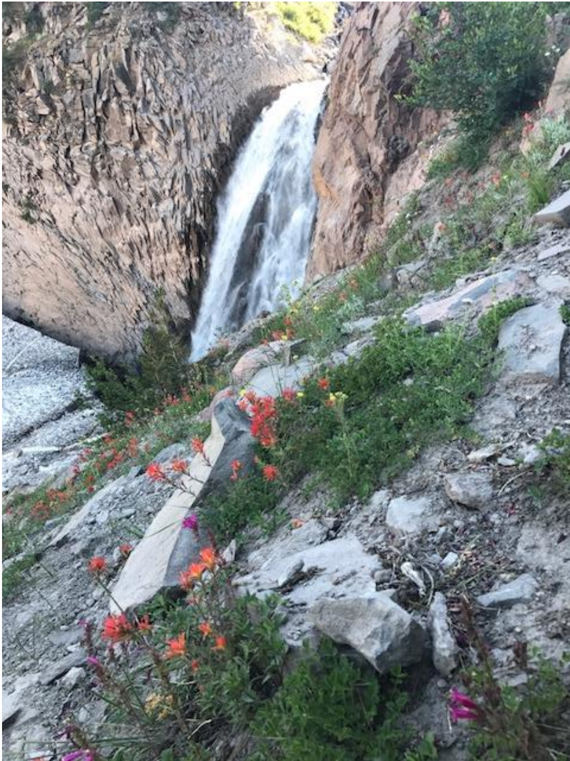
There are many beautiful waterfalls on Mount Shasta. Some are easier to access than others. Here, Mud Creek Falls plunges over a cliff edge as it carves its way down Mud Creek Canyon.